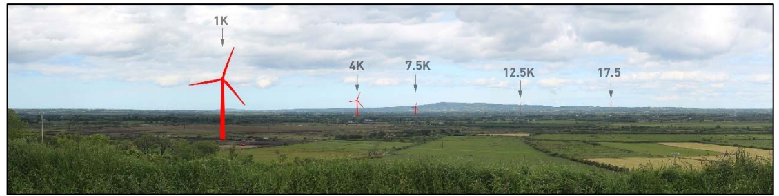
Figure 1-1 The effect of distance on visibility of wind turbines (Illustrative Purposes Only)